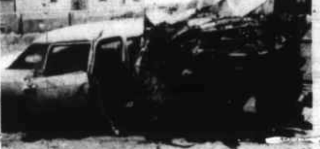
Three Garwood residents died and a fourth was seriously injured when the 1977 Lincoln Continental shown above collided almost head-on with a flatbed truck in front of Kates Supply on Highway 71 between Nada and Garwood at 11:45 a.m. last Wednesday.